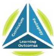
Concept of Academic Advising